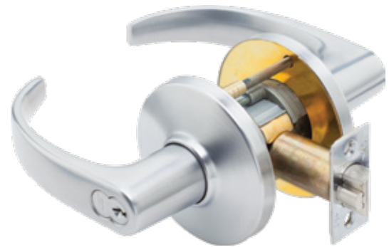
BEST 9K Series Heavy Duty Cylindrical Locks

Depending on the microbe type, Agion's antimicrobial technology has been shown to initially reduce microbial population within minutes to hours while maintaining optimal performance for years.